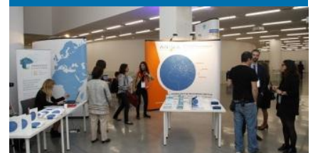
EMEA Business Forum 2-3 November 2016 Marseille, France